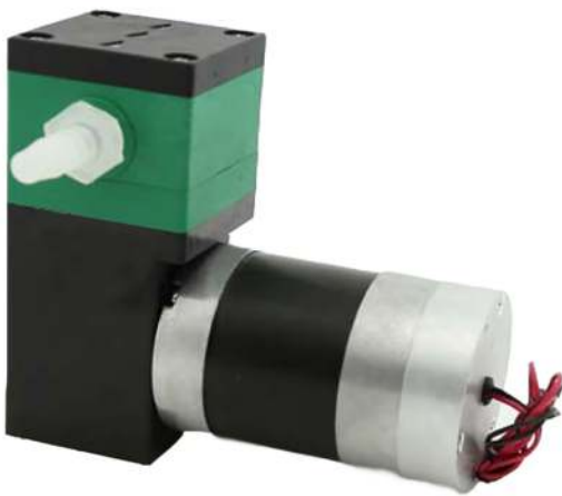
F51A-C: internal controller type